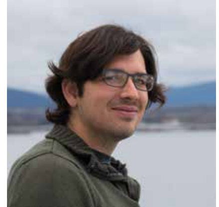
Alden Denny Acoustics team